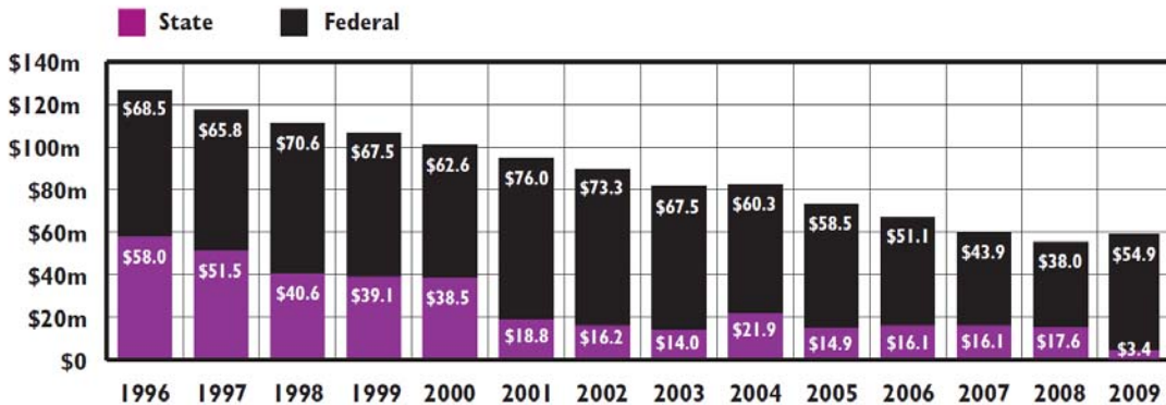
Rhode Island Cash Assistance Expenditures, State Fiscal Years 1996-2009

Source: Rhode Island Department of Human Services, Family Independence Program 2007 Annual Report . (FY 1996-2001); House Fiscal Advisory Staff. (2004-2009). Budget as enacted: Fiscal Years 2005-2010 . (FY 2002-2007). House Fiscal Advisory Staff. (2010). Governor's FY 2010 revised budget . (FY 2008-2009).